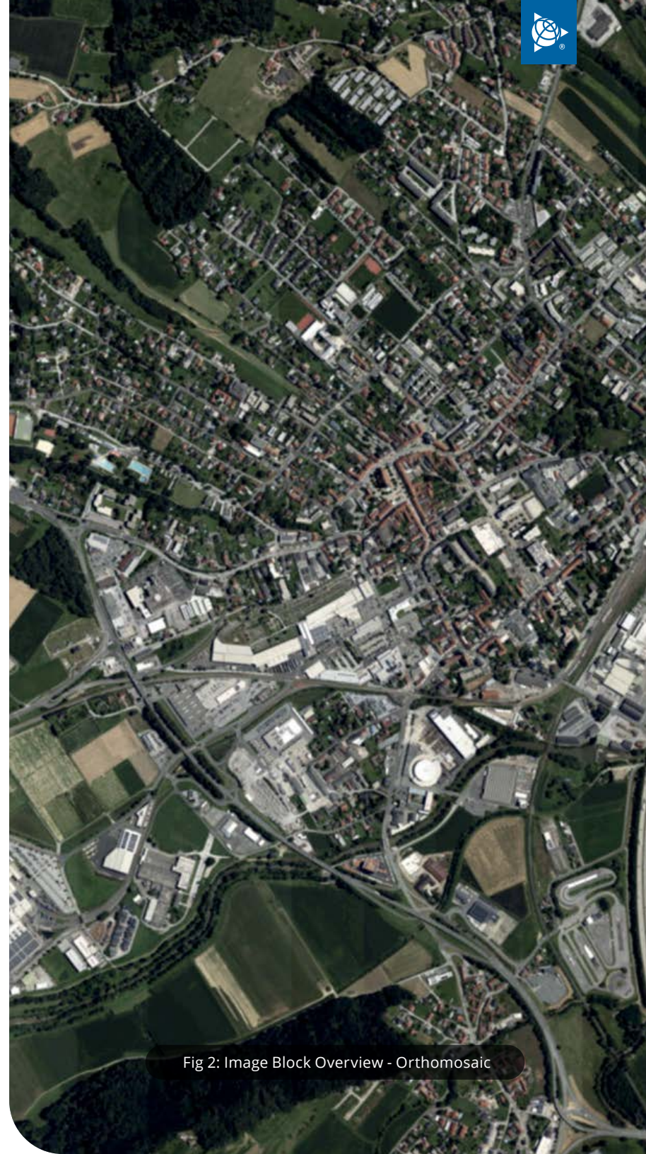
Fig 2: Image Block Overview - Orthomosaic