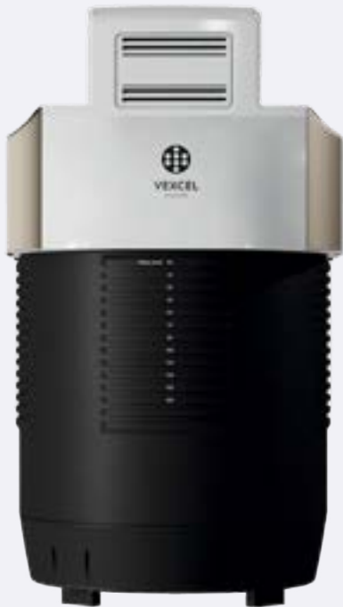
Fig 1: UltraCam Eagle